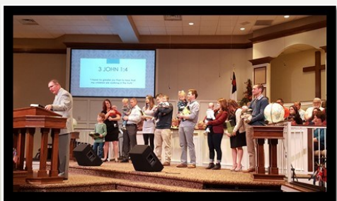
Family Dedication 2016