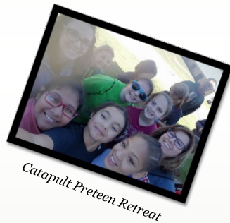
Catapult Preteen Retreat