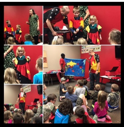
AWANA children learning about missions!

https://s3.amazonaws.com/mrmarksclassroom/AdventDevotionalGuide2016.pdf